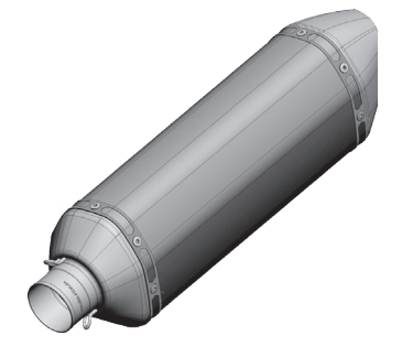
SERIAL NUMBER POSITION